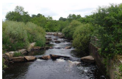
3 years after construction.