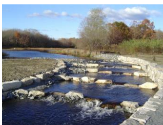
A fishway was constructed and the site rehabilitated