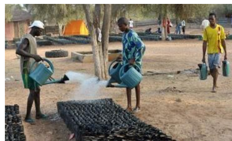
Workers tending seedlings in Senegal as part of the Great Green Wall, a 15km wide strip stretching 7,600km from Senegal to Djibouti.

The researchers argue the ecosystem services concept helps to identify the interventions needed to achieve both ecosystem health and social goals. They provide case studies to demonstrate their argument. One case study refers to the so-called 'Great Green Wall' stretching across the semiarid, highly degraded, and densely populated belt on the southern fringe of the Sahara desert. Cultural aspects are as important for success as technical and scientific aspects in such a project. The practitioners and scientists in the Great Green Wall project are working with motivated local communities on long-term projects aimed at kick-starting the restoration of natural capital at local scales. Ultimately, the local communities must be convinced that there is a tangible benefit for them in terms of their livelihoods and well-being. To read more of this study by Alexander and others in Ecology and Society : http://dx.doi.org/10.5751/ES-08288-210134 [Open access]