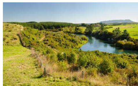
Riparian replanting and protection on the Waikato River, New Zealand.

Researchers in New Zealand have assessed the effectiveness of riparian buffers in terms of impact on water quality and the macroinvertebrate community. In New Zealand, around half of the lowland water bodies do not meet water quality standards and there have been many projects over the past 30 years to restore riparian areas. The researchers found there were some improvements associated with riparian restoration but these were not consistent across all sites. Restoration increased dissolved oxygen and decreased turbidity but the macroinvertebrate response varied. Read more of this research by Collins and others in Restoration Ecology : http://dx.doi.org/10.1111/j.1526-100X.2011.00859.x .