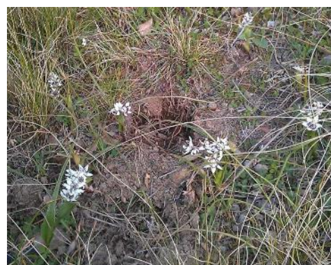
Not just a hole in the ground - Bettongs dig thousands of small holes, creating reservoirs for rain in dry Australian forests.

Australia's Bettongs, once exterminated as agricultural pests, are now threatened by habitat loss and introduced predators such as foxes and cats. Scientists recently learned that Bettongs act as 'ecosystem engineers', dramatically encouraging and enhancing Australia's forest habitat in numerous ways. Bettong restoration efforts are well supported by the national and state governments, with fenced-in populations thriving. At Mulligans Flat near Canberra, Australia, for example, Eastern Bettongs have been introduced into a fenced enclosure and the population has grown from 60 to 250 individuals in the past four years. Each individual has been estimated to move close to 8 kilograms (17.6 pounds) of soil per night. Read more about the project at http://www.mfgowoodlandexperiment.org.au/bettong.html and more about the case for reintroduction of bettongs in ecosystems at http://news.mongabay.com/2015/10/amazing-but-overlooked-bettongs-the-case-for-australias-small-hopper/ .