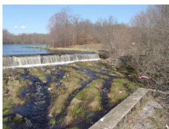
The original Acushnet Sawmill Dam contributed to water quality problems in New Bedford Harbour.

From the 1940s to the 1970s, New Bedford Harbour, in Massachusetts, USA, was on the receiving end of waste containing PCBs and heavy metals. 18,000 acres were contaminated: one location having the highest concentration of PCBs ever recorded in the marine environment. In 1992, natural resource damage assessment settlement was reached with the responsible parties for $20.4 million. Since 1998, 37 restoration-related projects have been implemented, supporting the preservation more than 690 acres of land, helping to restore and enhance wetlands and fish and bird habitats. To read more of this ongoing success story: https://darrp.noaa.gov/hazardous-waste/new-bedford-harbor .