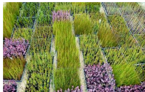
Native seedlings grown from provenance seed is one factor contributing to the successful reinstatement of grassy groundcovers.

The Grassy Groundcover Research Project has been recently reported to include nearly 100 sites on ex-agricultural land and roadside where complex grassland plant communities have been consistently reconstructed on bare fields. Across the country, native ground-layer species are being successfully returned as functional, resilient and attractive vegetation. Many Grassy Groundcover Research Project sites are now eligible for protection under the Commonwealth Environment Protection and Biodiversity Conservation Act , with one site (near Geelong, Victoria) assessed as high to very high conservation significance. Critical to success is the development of Seed Production Areas capable of supplying large quantities of high quality seed of known genetic origin and diversity. Read more at https://www.greeningaustralia.org.au/project/grassy-groundcover-restoration Or take a video tour of one of the Seed Production Areas.