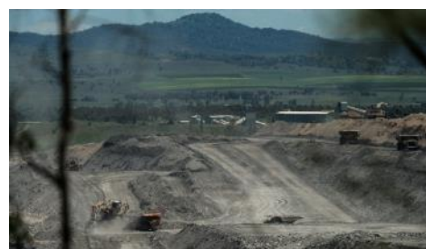
Permanent changes to soil, hydrology and topography might mean a different post-mine ecosystem to what was prior to mining activity.

https://www.researchgate.net/profile/Patrick_Audet/publication/289507727_Chapter_4ID_38431_7x10_DD_2/links/568d79bd08aef987e565f848.pdf .