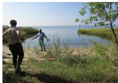
A stretch of Chesapeake Bay shoreline where plantings and rock jetties are providing habitat and preventing erosion.

https://www.washingtonpost.com/national/health-science/reshaping-the-chesapeake-bay-one-living-shoreline-at-a-time/2016/03/14/9c223a4c-c51d-11e5-8965-0607e0e265ce_story.html