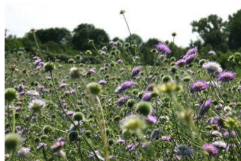
The Field Scabious shows pronounced genetic differences between northern and southern Germany.

Researchers have found that using local provenance seed is as good for grasslands as it is for forests. In Germany, using local seed is required when replanting forest trees, but this has not been considered necessary for the replanting of grasslands and meadows. Researchers studied the genetic differences between common grassland plants from various geographic regions of Germany and how these differences affected growth and flowering when planted at a range of sites, some out of their home range. One finding was that, on average, plants grown within their home range produced 7% more biomass and 10 % more inflorescences than plants of the same species that came from other regions. From 2020, grassland restoration in Germany will have to use indigenous seed. Two studies have been published in the Journal of Applied Ecology : one by Durka and others focusses on the genetic differentiation ( http://dx.doi.org/10.1111/1365-2664.12636 ) and the other by Bucharova and others on the lessons from the experimental work ( http://dx.doi.org/10.1111/1365-2664.12645 ). For a summary: https://www.sciencedaily.com/releases/2016/03/160321081424.htm .