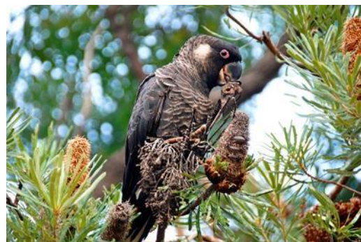
Carnaby's Black-Cockatoo. Despite progress, population counts over the past six years of suggest that the population has dropped by 15% each year.

https://theconversation.com/cocky-count-how-perths-green-growth-plan-could-wipe-out-was-best-loved-bird-56442