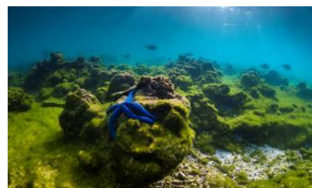
A damaged section of reef. The study showed that no-take areas resist damage better and recover more quickly than unprotected reefs.

https://theconversation.com/banning-fishing-has-helped-parts-of-the-great-barrier-reef-recover-from-damage-55828