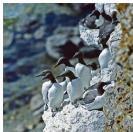
Breeding Common Guillemots in the island of Stora Karlsö in 1960.

In 1880, the picturesque Swedish island of Stora Karlsö became a nature preserve and, in the 1920s, to help fund the venture, the owners organized tours. The island remains a popular tourist destination, attracting about 10,000 visitors each year, and one its main attractions is its seabird colony. And that means that the colony of seabirds living on the island has had its picture taken over and over again, for almost 100 years. Researchers have used many of those photos to reconstruct the rise and fall of Common Guillemots, one of the largest Auk species. Those data show that despite the Guillemots declining early in the 20th century, their numbers have now risen to a historically high level. The population is currently increasing at an unprecedented rate of about 5% annually, whereas elsewhere it is decreasing. Read more: https://www.sciencedaily.com/releases/2016/03/160321123530.htm