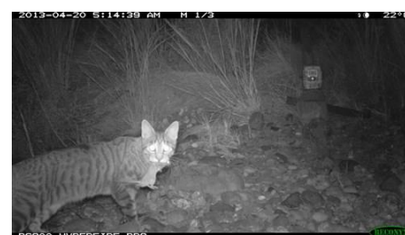
A cat caught the prowler by a camera trap.

Many studies are being conducted across Australia on the density, impacts, and behaviours of feral cats, but the largest of its kind – conducted at the Australian Wildlife Conservancy's Mornington-Marion Downs Wildlife Sanctuary in the Kimberly, Western Australia - found intensive fire and feral herbivory exacerbated cat predation. The study found that 28% of animals killed by cats were not eaten. This tendency for 'surplus killing' combined with higher impacts of cats in habitat opened up by fire or grazing, which makes hunting easier, helps explain why many small mammals in northern Australia have declined substantially only in the past few decades even though feral cats have inhabited the north for up to 170 years. However, the study also found there was no 'silver bullet' to solve the problem. Integrated solutions will still be required, including more feral predator-free areas, more effective baits and pursuing the scientific quest for regional-scale solutions. Read more: http://www.australianwildlife.org/media/274631/saving-mammals-wildlife-australia-autumn-2016.pdf