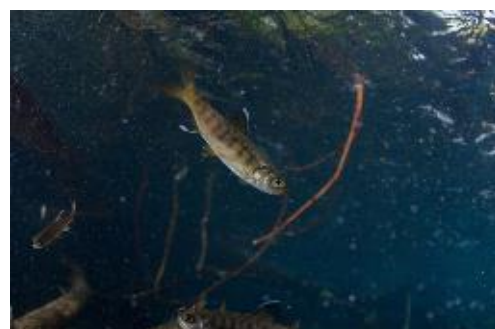
Juvenile Coho Salmon survival was found to have increased 50 % in summer and 300 % in the winter after restoration improved rearing habitat.

'Intensively Monitored Watersheds' uses technology to provide researchers with sufficient detail over longer timeframes to enable them to identify whether fish populations are increasing and whether this is due to the improvements in the habitat. Researchers used this approach in 17 watersheds in the USA Pacific Northwest. Their findings from various sites include a 250 % increase in numbers of juvenile fish in areas with restored habitat compared to those without; a 400 to 800 % increase in fish numbers in response to the reconnection of side channels; and a 175 % increase in juvenile Steelhead in response to reduced erosion and a higher water table. They have also identified Coho Salmon migration patterns that have implications for the resilience of local populations of this species. Read more of this work by Bennett and others in Fisheries , http://dx.doi.org/10.1080/03632415.2015.1127805 or a summary, https://www.sciencedaily.com/releases/2016/02/160201104034.htm .